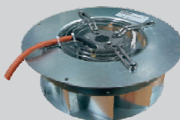
2RREt45 250x56R inverse

Air conditioning of the driver's cab Electronics cooling